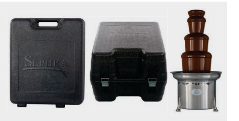
INCLUDES A DOUBLE-WALL POLYMER TRAVEL CASES